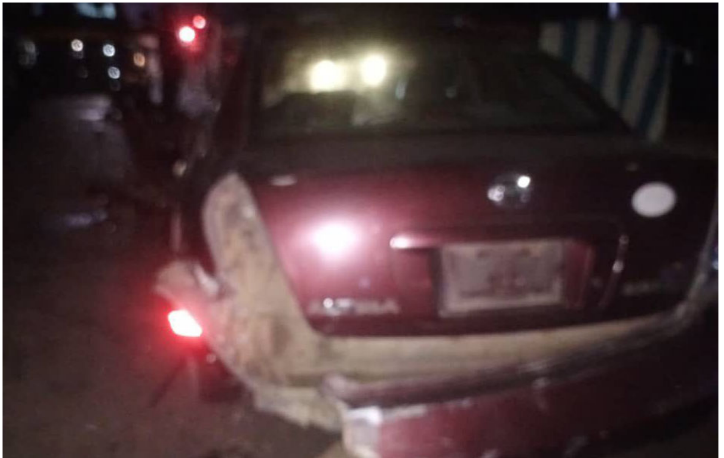
Scene of the accident