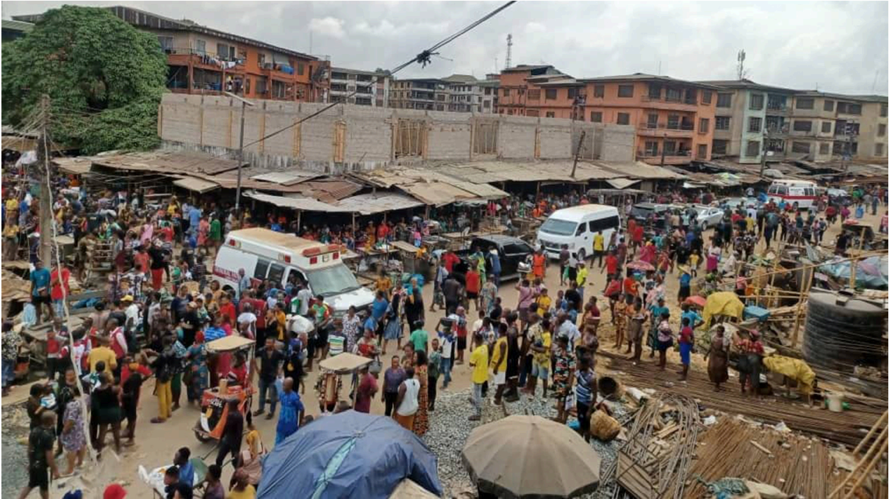
Scene of the collapsed building in Onitsha, Anambra State, yesterday.

Five people were reportedly killed while 26 others were rescued following a building collapse which occurred on Monday night, at Odu-Igbo market, Ochanja, Anambra State.