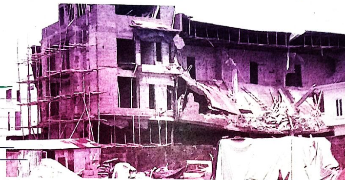
Newly collapsed building under construction at Osapa London, Lekki, Lagos

But Lagos Deputy Governor, Obafemi Hamzat, who arrived at the Ikoyi scene, around 11:00a.m, yesterday,