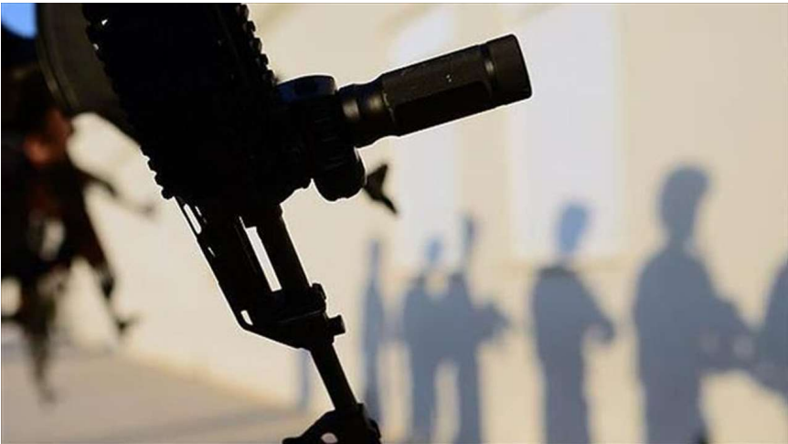
{FILES} gunmen.