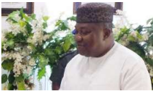
Ugwuanyi evacuates Enugu students in UNIJOS 7 hours ago

The appeal has since generated mixed reactions. THIS is even as the state chapter of Coalition of Northern Groups (CNG) urged the governor to resign over pervasive insecurity.