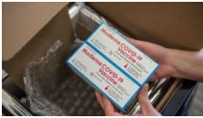
Ebonyi govt takes delivery of COVID-19 vaccines 8 hours ago

“The only things they take from governors are the financial and material assistance (both solicited and unsolicited), which they extend to the security institutions in the states. Governor Masari is second to none when it comes to proactive engagement with security agencies in the state.”