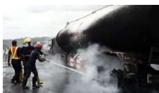
Tanker fire claims two lives, destroys property in Anambra