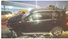
Septuagenarian escapes death at Lagos road construction site

By Collins Osuji, Owerri 13 August 2021 | 4:03 am