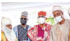
Abiodun urges political office holders to serve people, avoid oppression

“We are not aware of what they are saying. We did not attack them. They are the ones that attacked us. As we speak, three of our youths are still missing and we are still searching for them,” he said.