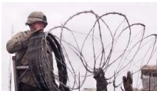
US, UK to launch evacuation flights as Taliban advance across Afghanistan