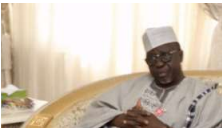
Niger senators set to tackle Al-Makura, others for APC chairmanship seat 6 hours ago

It was gathered that the gunmen, numbering about eight, laid ambush for the victims at Adeaga/Alaagba village in Odeda Local Government Area of the state on Wednesday. It was further gathered that the fierce-looking gunmen suspected to be herdsmen were dressed in a black caftan and abducted the expatriates in the village located between Oyo and Ogun States. The police spokesman in the state, Abimbola Oyeyemi, confirmed the incident.