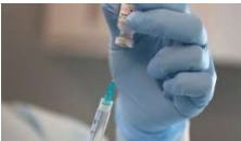
Experts rally businesses on digital disruption to cushion COVID-19 effect 6 hours ago

Four Chinese working at the Lagos-Ibadan standard gauge railway project were yesterday, abducted in Ogun State by gunmen while a policeman was killed during the operation. The policeman was one of the security men escorting the Chinese expatriates who were abducted.