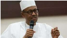
'Neglect of grassroots stifling governance in Nigeria'

“We have started the investigation. We are on the trail of those people and hopefully, we are going to get them.