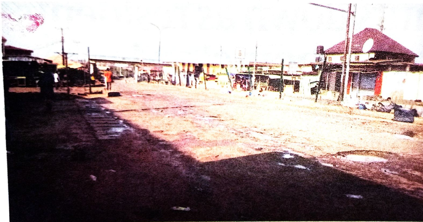
Deserted Mayor Market in Enugu...yesterday.

Also in Ebonyi, the exercise led to the violent death of five persons. There was a gun duel between the police and IPOB agitators within Ebebe junction in Abakaliki, the capital city.