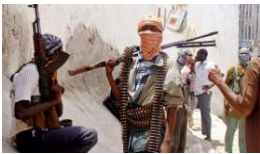
Ebubeagu, police arrest 37 UGM in Ebonyi