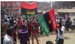
Igbo think tank flays shoot-on-sight order against IPOB members

Scores were injured while many others were robbed at Oshodi area of Lagos when soldiers attached to the Nigeria Air Force clashed with motor park ‘officials’ popularly called hoodlums.