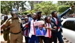
Uganda opposition leader arrested in anti-Museveni protest

“We condemn the kidnap of about 39 staff and students of Federal School of Forestry, Afaka in Kaduna State by bandits,” he stated.