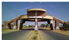
Katsina children's parliament decries sexual abuse, molestation