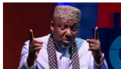
Okorocho arrested to deny South East presidency in 2023, group alleges