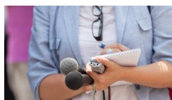
MRA urges Niger governor to probe harassment of journalist