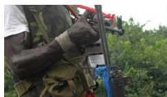
Again, gunmen kill police officer in Delta community

Concerns over insecurity in the country reached a feverish point yesterday as bandits launched another attack in Niger State.