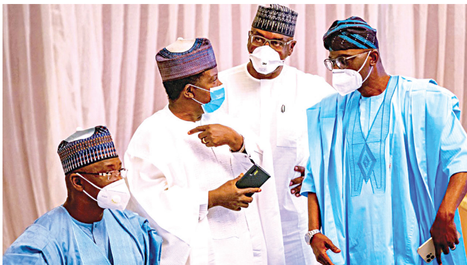
Governors of Nasarawa State, Abdullahi Sule (left); Plateau State, Simon Lalong; Kwara State, Alhaji AbdulRahman AbdulRazaq and Lagos State, Babajide Sanwo-Olu during the National Economic Council (NEC) meeting held at the Banquet hall, Presidential Villa, Abuja...yesterday.