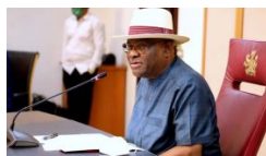
Wike cautions governors against using COVID-19 as excuse for failure

EARLIER yesterday, the Northern States Governors Forum had declared it was distressed and saddened by attacks and abductions, particularly the abduction of students, staff and families of the Government Science School, Kagara in Niger State by suspected bandits.