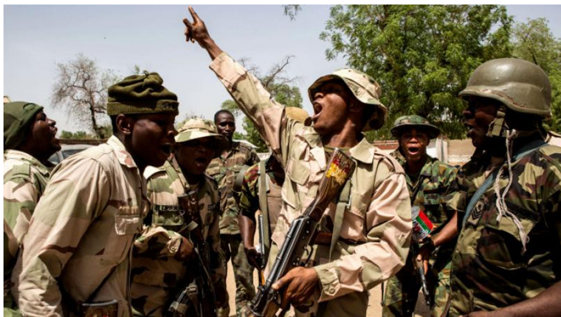
Nigerian troops .