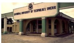
VC, host communities' attorney trade words over FUTO land