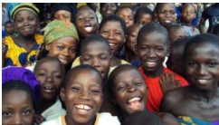
NAWOJ, NGO distribute food, clothes to children, widows in Cross River 6 hours ago