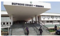
OYSIEC fixes May 15 for council poll ahead of Supreme Court judgment

“There is a need for us to overhaul the security structure of that place. Not only the Eggua side, but the entire Yewa axis will also be completely overhauled. The Commissioner of Police has made adequate deployment so that such incident will not