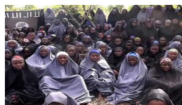
Kidnapped Chibok schoolgirl escapes from Boko Haram