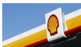
Dutch court orders Shell to pay Nigerian farmers over oil spills