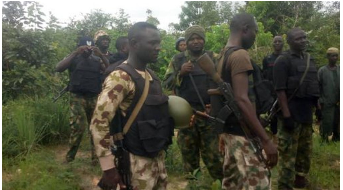
Nigerian Army<br />

Troops of 402 Special Forces Task Brigade of Operation Tura Takaibango (OTTB) have killed five Boko Haram terrorists in the Abbagajiri and Dusula hideouts of Damboa local council of Borno State.