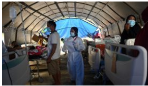
Indonesian medics overwhelmed by quake casualties