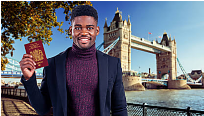
Work In The United Kingdom And Become A British Citizen! UK Immigration Consultants | Sponsored