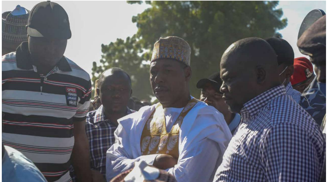
Babagana Zulum (middle) during burial of Borno State farmers killed by Boko Haram terrorists...yesterday.