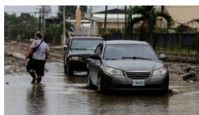
Hurricane Iota tears through Central America after Nicaragua landfall

One of the survivors who pleaded anonymity said: "While we were returning from Minna, Niger State as we approached Akilubu axis, some armed men suddenly jumped on the highway and started shooting. We were lucky to escape stray bullets. I have never seen such a thing in my entire life."