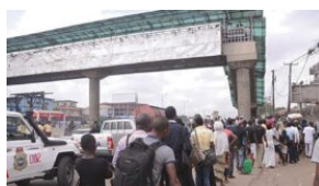
Ojota service lane closed for six weeks