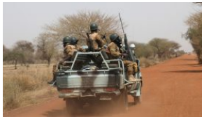
Seven soldiers killed in Burkina Faso attack

An angry crowd yesterday set two suspected armed robbers ablaze at the Refinery Junction in Uvwie Local Government Area of Delta State. An eyewitness, however, told newsmen that a third suspect escaped.