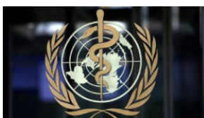
Trolls get creative after WHO censors Taiwan

According to eyewitnesses, it was the gunshot that attracted the attention of the youths, most of whom were Okada riders, who gave him a hot chase, caught up with him at Otukpo road, near Hotel Bobec and set him ablaze.