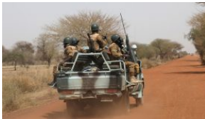
Seven soldiers killed in Burkina Faso attack

The source said the suspects, who operated in a tricycle, snatched a handbag containing huge sum of money from a teacher, shot and wounded her. The teacher is currently receiving treatment at an undisclosed hospital.