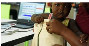
160,000 Nigerian children die of pneumonia yearly