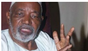
Buhari, Obasanjo, Jonathan, govs mourn as Balarabe Musa dies at 84

She said that more crashes were recorded during the period because it was in the rainy season, and most people were in a hurry due to the lifting of the restrictions on movement during the COVID-19 lockdown period.