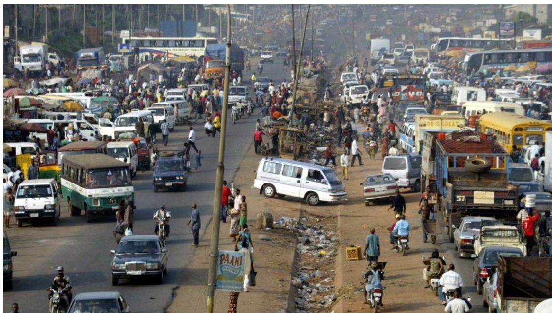
[FILE PHOTO] Onitsha