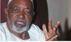
Buhari, Obasanjo, Jonathan, govs mourn as Balarabe Musa dies at 84

They were arrested following a complaint lodged at Owode Egba divisional headquarters by the mother of the victim. The mother informed the police that the suspects abducted her daughter on November 3, at about 8:30p.m, took them to an unknown place, and forcefully have carnal knowledge of their victim.