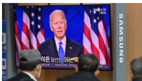
China declines to acknowledge Biden victory 4 hours ago

In a statement, the medium said Onifade was covering the scene of a mob attack at a government facility in the Oko Oba axis of Agege Local Government Area when operatives of the task force stormed the scene and engaged hoodlums who attempted to loot palliatives at the Ministry of Agriculture store in the Abattoir area of the state.