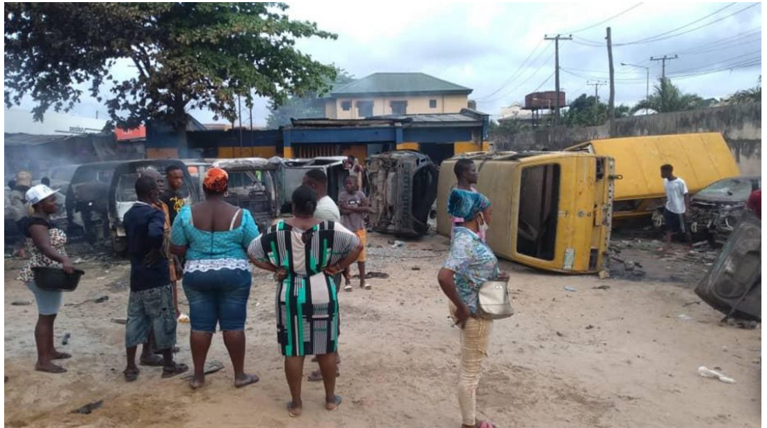
Cele Police Station burnt by hoodlums, who were also butchering and carting away parts of vehicles parked in the station.