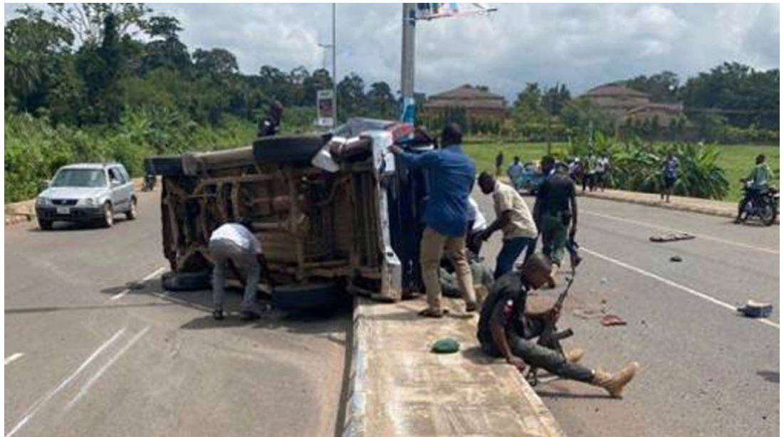
The accident scene in Ondo

Two police officers, who were on election duty in the governorship election in Ondo State, have died in an auto crash.