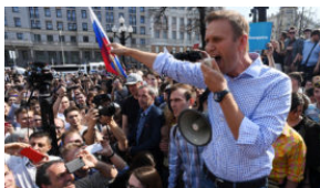
Russia protests Germany's 'accusations and ultimatums' on Navalny