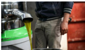
JAF, others protest against fuel price hike in Ibadan

According to the Anambra Broadcasting Service Radio, the lady from Iruokpala, Ire Village in Abba, Njikoka Local Government Area of Anambra, was believed to be a victim of fraudsters or kidnappers who lured her into the hotel for ritual purposes on August 27.