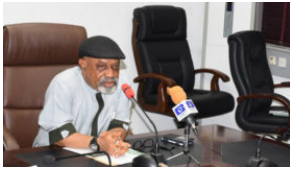
Doctors' strike: FG approves additional N8.9bn for June COVID-19 hazard allowance