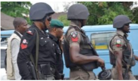
Police begins investigation into murder of councillor in Bayelsa

The governor advised residents of Opebi and its surroundings to go about their businesses peacefully, saying: “There is nothing to fear, as men and officers of the state emergency services were promptly deployed to the scene, brought everything under control and the environment is also safe and secure.” He prayed that God would grant the deceased eternal rest and the families they left behind the fortitude to bear the irreplaceable loss.