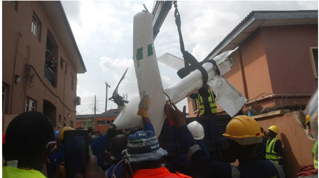
Wreckage of Quorum Aviation Limited helicopter that crashed into a residential building on Salvation Road, Opebi, Lagos being retrieved by officials of the Lagos State Emergency Management Agency (LASEMA), National Emergency Management Agency (NEMA) and others at the scene...yesterday