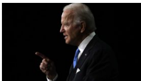
Trump wants Biden to take 'drug test' before first debate

"Nobody died. Not even the conductor who fell off the vehicle as a result of the way his driver drove to evade arrest. He is admitted in the hospital. What happened was that the task force team was going for enforcement when they saw the bus driving against traffic. The driver also saw them and to evade arrest, he made a quick turn. Because of the speed, the door to their bus, which had already pulled out, fell off and the conductor fell with it.