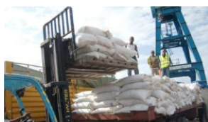
Maize import policy raises dust