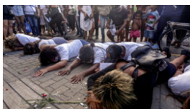
Black boy's death sparks racism protest in Brazil

The victim was beaten on May 13, where she went to study. She died on May 31, 18 days after, at the University of Benin Teaching Hospital. She was 22 years old. It was gathered that the Ikpoba Hill branch of the church where the incident occurred was on Sunday morning set ablaze allegedly by angry students of the university.