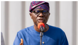
Lagos government charges religious centres on "No face mask, No entry" guideline

The member of the university SUG who pleaded anonymity explained that the victim was beaten to a pulp and later died at the University of Benin Teaching Hospital (UBTH), where she was rushed to for treatment on Saturday night. The Guardian investigation revealed that the victim died at the University of Benin Teaching Hospital on Saturday after all frantic efforts to save her.