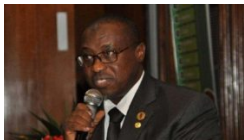
Northern governors mourn former NNPC boss