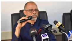
COVID-19 mortality rises to 50 in Lagos