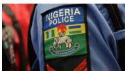
Police arrest 71 suspects for kidnap, rape in Borno