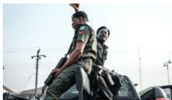
Police arrest 16 suspects over kidnapping, armed robbery, others