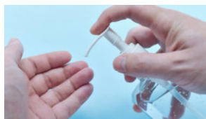
SON warns public to be wary of substandard hand sanitiser