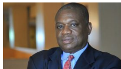
Supreme Court nullifies Orji Uzor Kalu's conviction