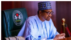
Nigeria waives import duty for medical supplies