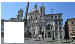
Good Friday prayer gets out of hand in locked down Italy

“However, to ensure more transparency and accountability, the Palliatives Committee will work with credible Civil Society Organisations (CSOs) to monitor the distribution,”