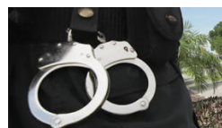
Police arrest 6 suspected armed robbers, recover AK-47, ammunition in Enugu