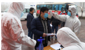
China quarantines 94 people on Seoul flight after 3 show fever