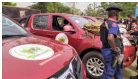
At public hearings, Yoruba leaders okay Amotekun

The current Commissioner of Police in the state, Hakeem Odumosu, had during his tenure as the head of the task force in 2003, dislodged criminals the area, only for them to resurface. The area had also been raided many times by the combined team of task