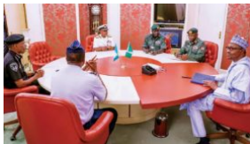
NSA absent as service chiefs meet Buhari, Kyari