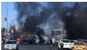
Iraqi protesters face off against cleric's followers