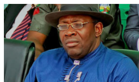
Dickson applauds Okowa, Ikpeazu's Supreme Court victory