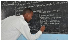
Rivers moves to enforce closure of illegal private schools