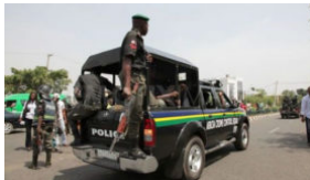
Police in Bayelsa rescue commissioner's abducted son