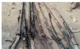
Army, NDLEA recover eight guns, 725 bags of suspected cannabis in Edo