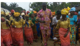
Ndokwa women seek politicians' assistance on poverty alleviation