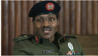
Buhari's spokesman reacts to Punch editorial

He is a multi-linguist, speaking English, French and German. After a Masters degree in Economics and applied management, he also attended the Maersk International Shipping Education.