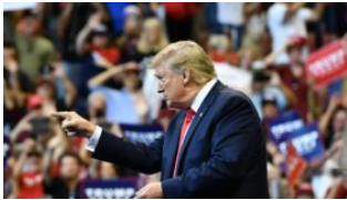
Trump says will designate Mexican cartels as 'terror' groups

He said the nexus between peace and security was paramount to the socio-economic development processes of various sectors of the economy.