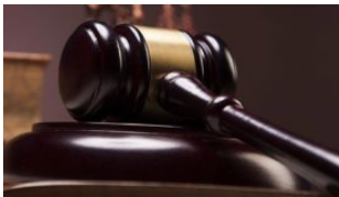
Woman drags businessman to court for alleged sodomy