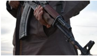
Camel-riding gunmen kill six in Adamawa