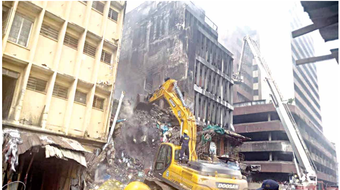
Scene of the fire incident