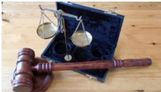
Activist fights for independence of legislature in Ebonyi