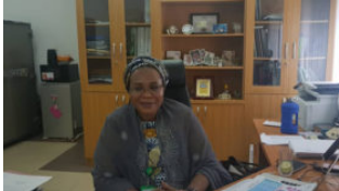
NIMC partners World Bank, EU to register every citizen